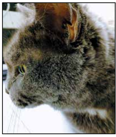
"I'm ready for my close up!" Miss Mulvey

Please call Rich at 860-399-3095, if you wish to make a donation or volunteer the day of the event.