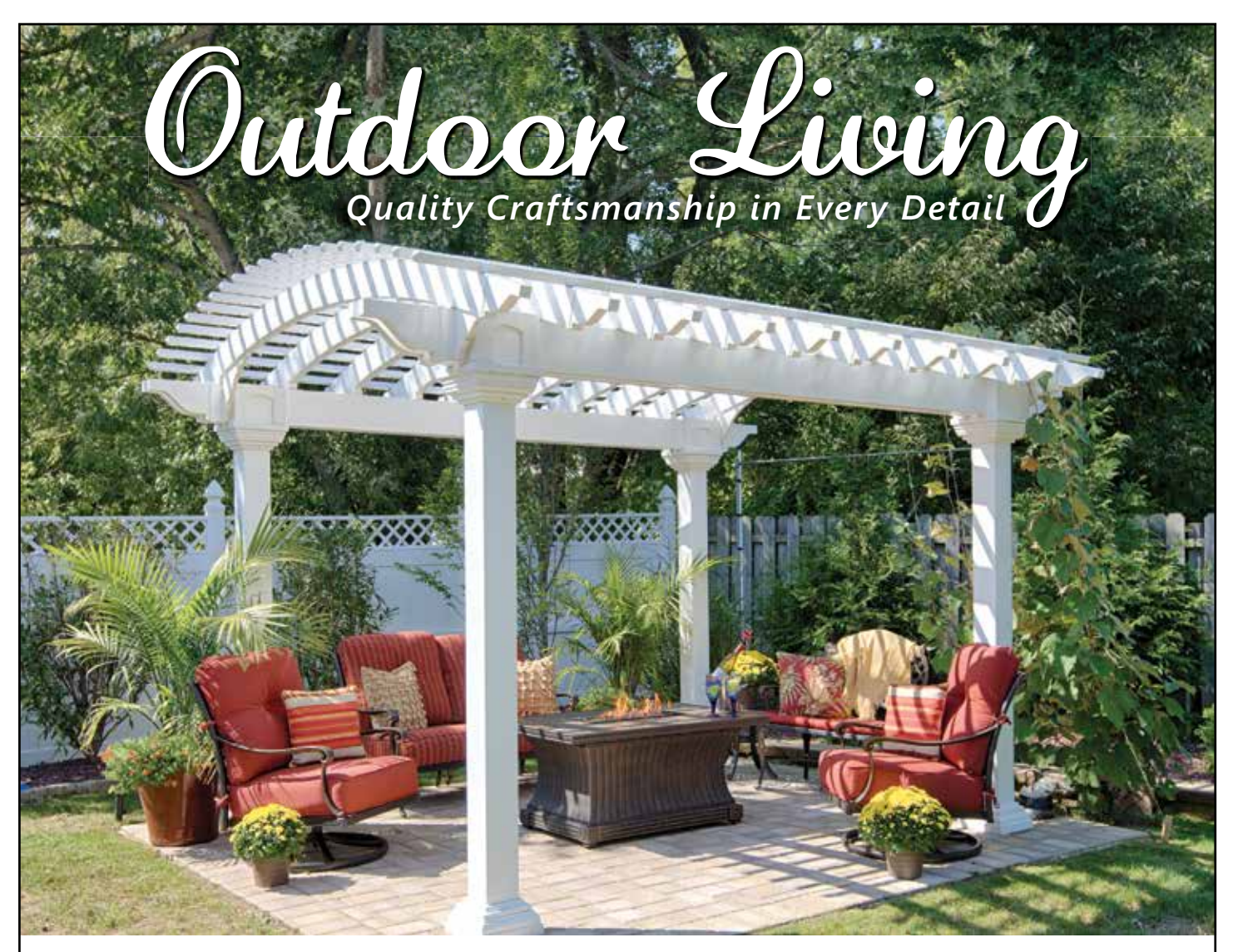
PERGOLAS • PAVILIONS • POOL HOUSES • SUNROOMS • PATIO FURNITURE Bring your ideas and we'll help you create the outdoor space you've always wanted. ORDER NOW FOR SPRING BUILD!