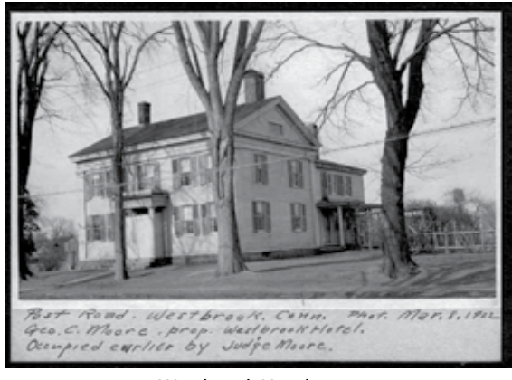
Westbrook Hotel 1922

The Tour is designed within the Westbrook's Town Center District, covering an area along the Boston Post Road from Water's Edge to the Mulvey Municipal Center, Old Clinton Road to the railroad overpass near Hammock Road, North, Wesley Avenue, to a portion of Seaside Avenue, and back along South Main Street. Juliana recently conducted her first tour with Girl Scout Junior Troop 62077.