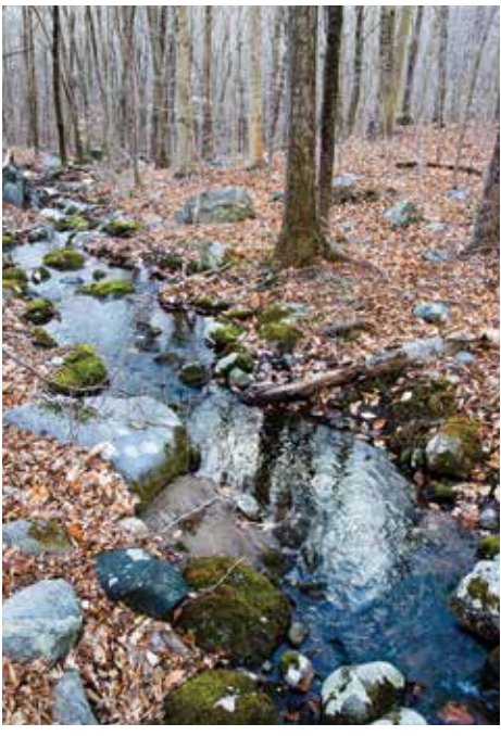
Toby Hill Phase VIII Property - Trout Brook

Since 1968, the Westbrook Land Conservation Trust has acquired outright 31 land parcels throughout Westbrook, totaling over 150 acres, as well as the conservation rights to 51 acres. If you live near one of our signs, and would like to join in stewardship of properties, or simply appreciate the protected open space we preserve, please consider joining this organization. Write or email us at: WLCT, PO Box 1124, Westbrook, CT 06498. Email: Wesbrook LCT@yahoo.com.