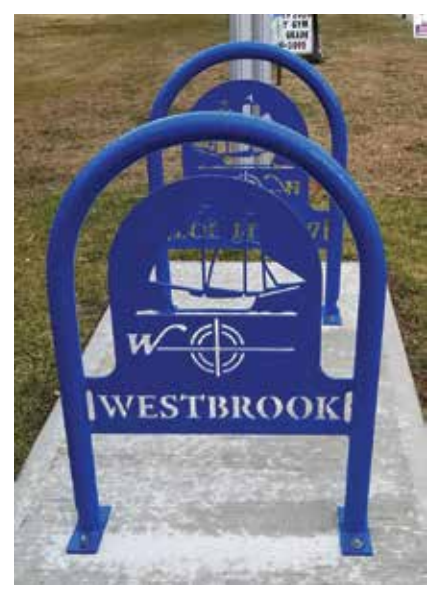
Two new bike racks on the Westbrook Town Green are among the new additions for residents and visitors.

Employing sustainable practices that both modernize and protect the small-town charm of our community is a top priority for economic development. Local, state